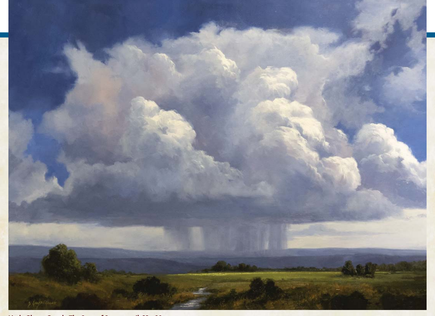
Linda Glover Gooch, The Song of Summer, oil, 22 x 30.